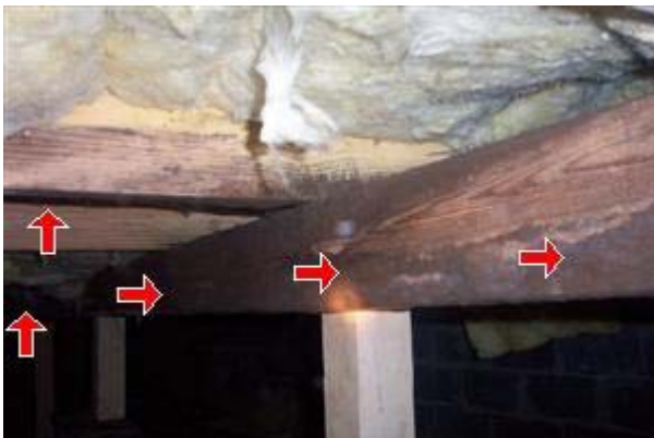
5.3 Picture 1

5.3 Signs of fungi growth is present on the floor system in crawlspace in several areas. We did not inspect, test or determine if this growth is or is not a health hazard. The underlying cause is moisture. I recommend you contact a mold inspector or expert for investigation or correction if needed.