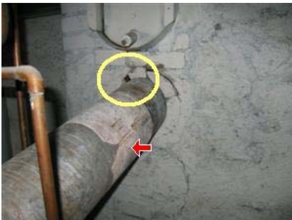
8.5 Picture 1

The vent pipe for oil fired boiler needs mastic sealed around pipe where it enters chimney. There is also a possibility of asbestos on the vent pipe. This is a safety issue and should be repaired. I recommend a qualified licensed heat contractor inspect further and repair as needed.