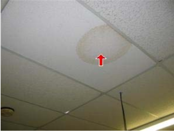
4.0 Picture 1

4.1 Signs of fungi growth is present on the interior wall of kitchen cabinetry in several areas. We did not inspect, test or determine if this growth is or is not a health hazard. The underlying cause is moisture. I recommend you contact a mold inspector or expert for investigation or correction if needed.