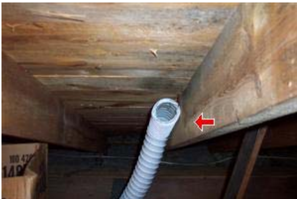
9.4 Picture 1

9.4 The Exhaust fan does not vent to outside at the guest bath. Vent pipes should terminate outside and not in the attic. Many homes have their vent pipe poised at the roof vent such as yours. It is up to you to determine whether or not this is a concern or needs further consideration from a general contractor. A qualified contractor should inspect and repair as needed.