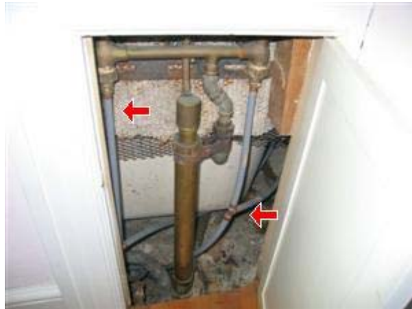
6.1 Picture 4

The water supply line for toilet is leaking at the guest bath. Repairs are needed. A qualified licensed plumber should repair or correct as needed.