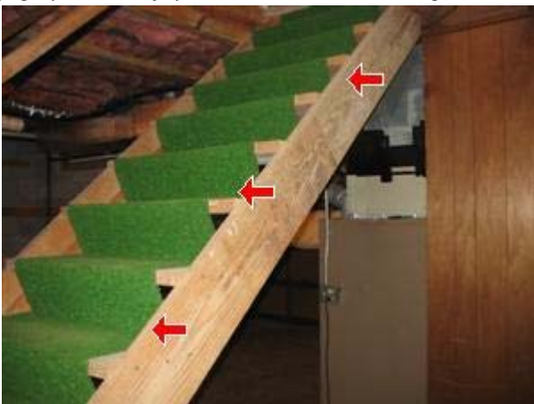
4.3 Picture 1

4.3 The hand/guard rail for the stairs to basement is missing and are missing pickets. Also the stringers are not built properly and treads are not supported properly. A fall or injury could occur if not corrected. A qualified contractor should repair or replace as needed.