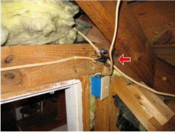
7.3 Picture 1