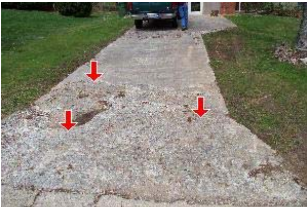
2.4 Picture 1

2.4 The concrete drive at the front of home are deteriorated in areas. A general replacement is likely. A qualified contractor should inspect and repair as needed.