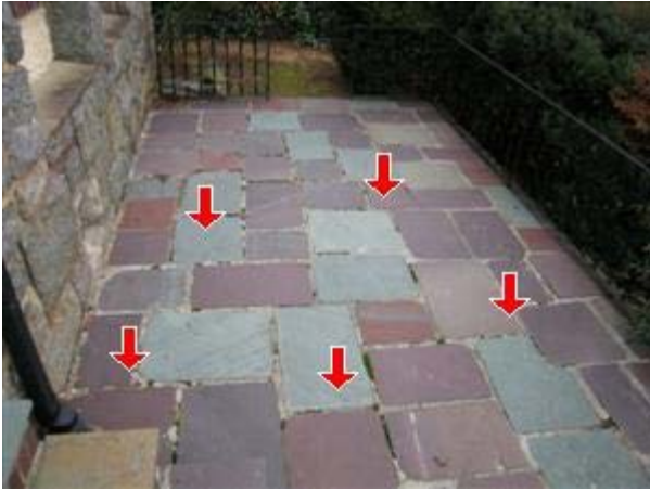
2.4 Picture 4

2.5 The soffit panel at eave on the front of home are weathered and beginning to deteriorate and peeling paint. Further deterioration may occur if not repaired. A qualified contractor should inspect and repair as needed.