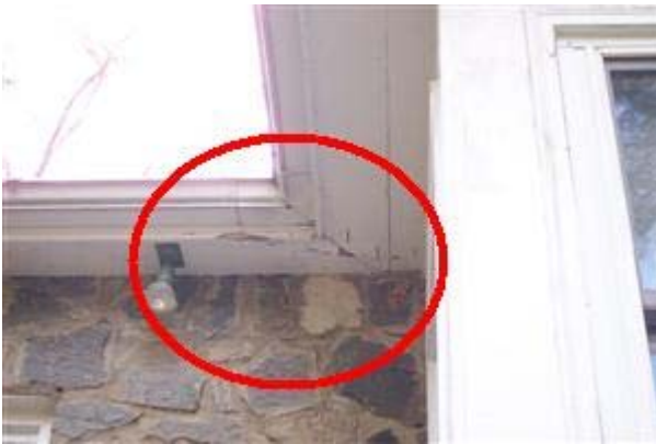
2.5 Picture 1

2.5 The soffit panel at eave on the front of home are weathered and beginning to deteriorate and peeling paint. Further deterioration may occur if not repaired. A qualified contractor should inspect and repair as needed.