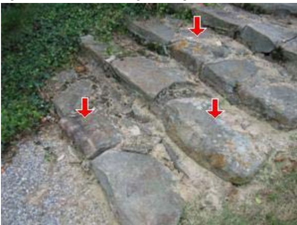
2.4 Picture 2

The rock steps at the front of home and rear of home are loose in areas. Water can cause further deterioration if not repaired and sealed properly. A qualified contractor should inspect and repair as needed.