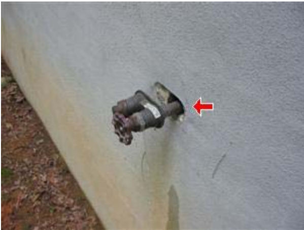
6.1 Picture 1