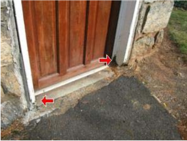
2.1 Picture 1

2.2 The window frame and wood trim is peeling paint at front of home. Further deterioration may occur if not repaired. A qualified contractor should inspect and repair as needed.