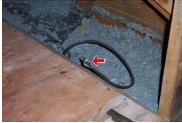
7.3 Picture 2

7.6 The main panel box is located at the basement.