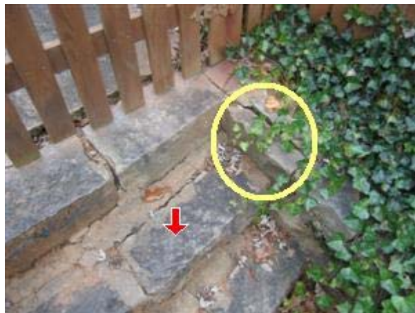
2.4 Picture 3

The slate floor on the patio at the front of home has deteriorated mortar or grout, and is loose and uneven in areas. A general replacement is likely. A qualified contractor should inspect and repair as needed.