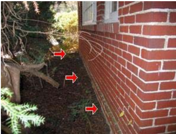
2.0 Picture 1

2.0 The Brick siding at the left side (facing front) is loose, and missing mortar. Further deterioration can occur if not corrected. A qualified contractor should inspect and repair as needed.