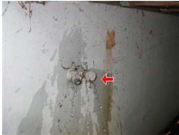
6.1 Picture 2

Polybutylene plastic plumbing supply lines (PB) are installed in the subject house. Polybutylene has been used in this area for many years, but has had a higher than normal failure rate, and is no longer being widely used. Copper and Brass fittings used in later years have apparently reduced the failure rate. This subject house has copper fittings. For further details contact the Consumer Plumbing Recovery center at 1-800-392-7591 or the web at http://www.pbpipe.com