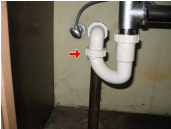
6.0 Picture 1

6.0 The waste line has a S-trap, and should be changed to a P-trap and "Auto-vent" at the Kitchen sink. This is not considered up to today's standard. A qualified licensed plumber should repair or correct as needed.