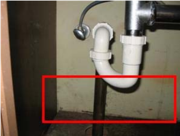
4.1 Picture 1

4.1 Signs of fungi growth is present on the interior wall of kitchen cabinetry in several areas. We did not inspect, test or determine if this growth is or is not a health hazard. The underlying cause is moisture. I recommend you contact a mold inspector or expert for investigation or correction if needed.