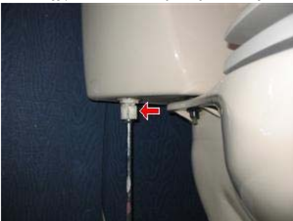
6.1 Picture 5

The water supply line for toilet is leaking at the guest bath. Repairs are needed. A qualified licensed plumber should repair or correct as needed.