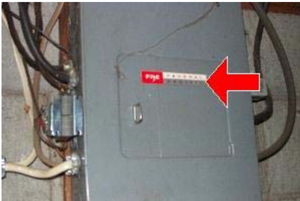
7.2 Picture 1

7.2 You have a Federal Pacific panel which is legal, but there is a possibility that the circuit breakers may not trip when shorted possibly causing an electrical hazard. Opinions by licensed electricians on this panel varies between safe and unsafe. I recommend you consult a licensed electrician for an opinion and correct if necessary.