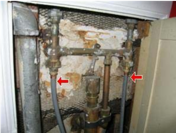
6.1 Picture 3

Polybutylene plastic plumbing supply lines (PB) are installed in the subject house. Polybutylene has been used in this area for many years, but has had a higher than normal failure rate, and is no longer being widely used. Copper and Brass fittings used in later years have apparently reduced the failure rate. This subject house has copper fittings. For further details contact the Consumer Plumbing Recovery center at 1-800-392-7591 or the web at http://www.pbpipe.com